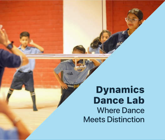
Dynamics Dance Lab Where Dance Meets Distinction