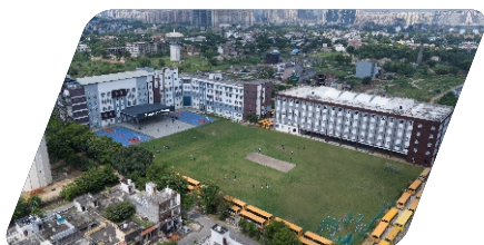
HS-1 & HS-4, Sector-3, Noida Extn.