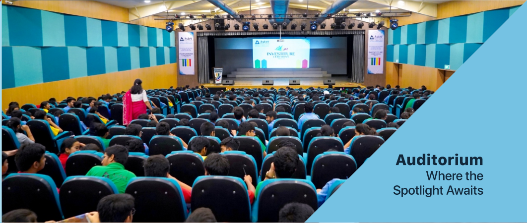
Auditorium Where the Spotlight Awaits