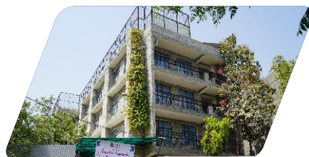
Mayur Vihar Phase-1, Delhi