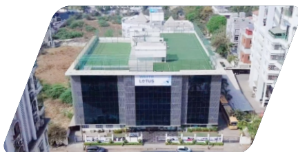
Vesu, Surat, Gujarat