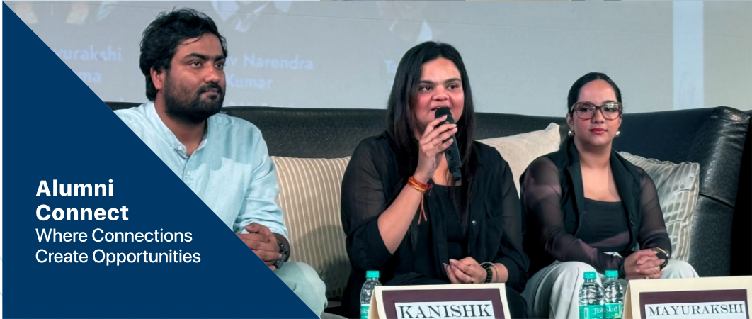
Alumni Connect Where Connections Create Opportunities