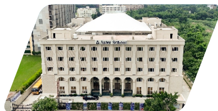
KP-1, Greater Noida