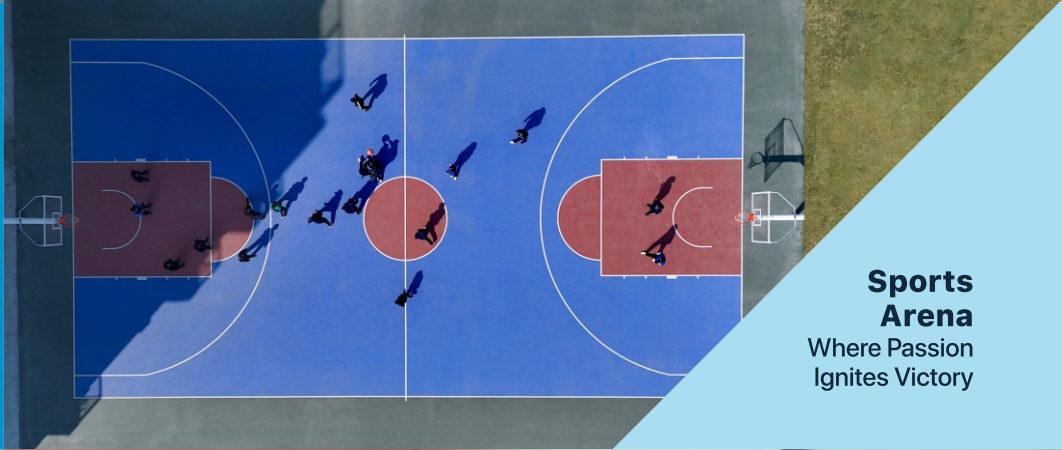
Sports Arena Where Passion Ignites Victory