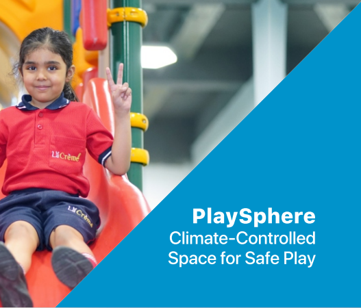
PlaySphere Climate-Controlled Space for Safe Play