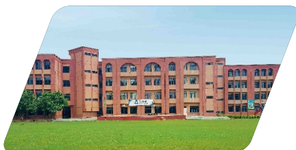
J-1, Delta-2, Greater Noida