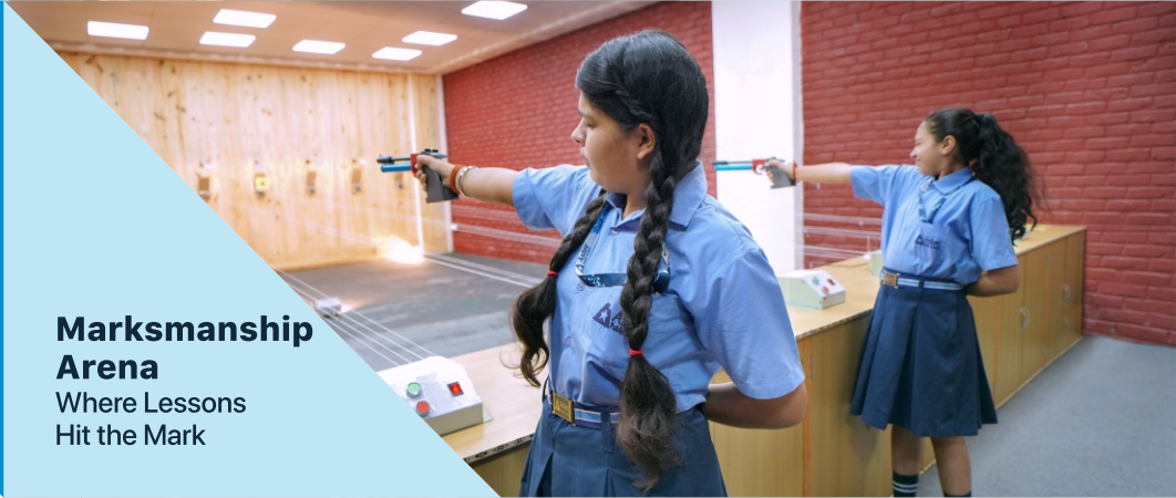
Marksmanship Arena Where Lessons Hit the Mark